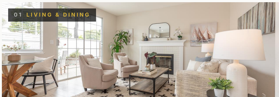
01 LIVING & DINING