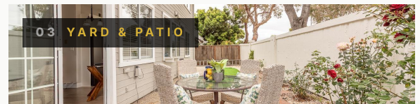
03 YARD & PATIO